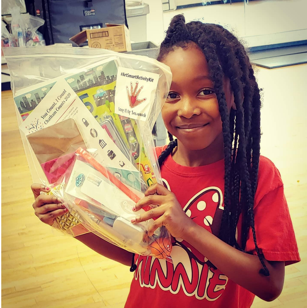
Student receiving her first ArtSmart Activity Kit created in response to school closures