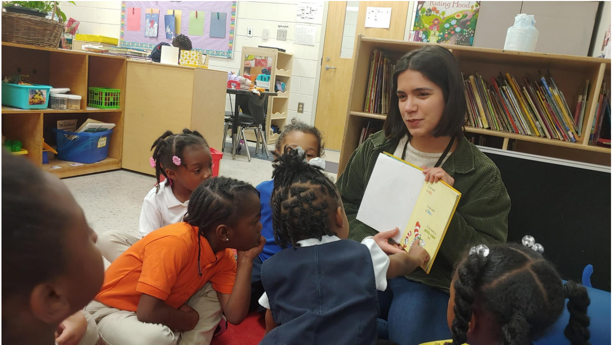
Looping Literacy Together volunteer reading to students at Otis J. Brock Elementary School

Our staff and many volunteers began another semester of Looping Literacy Together which included Weekly Reading Partnerships, Book Box Library projects, Music, Movement, and Art classes, and an interactive storytelling unit. The program uses literary, fine, and performing arts to offer different but complementary approaches to early literacy. The goal is to develop reading and writing skills from an early age and to encourage self-expression in both words and images.