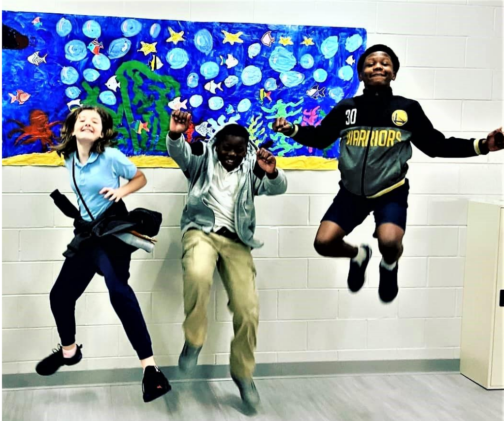
Mindfulness Zone students jumping in front of their group painting shortly before Covid-19 Pandemic

In late 2019 and early 2020 we began to dig more deeply into our mission of addressing childhood trauma and early literacy in our student population.