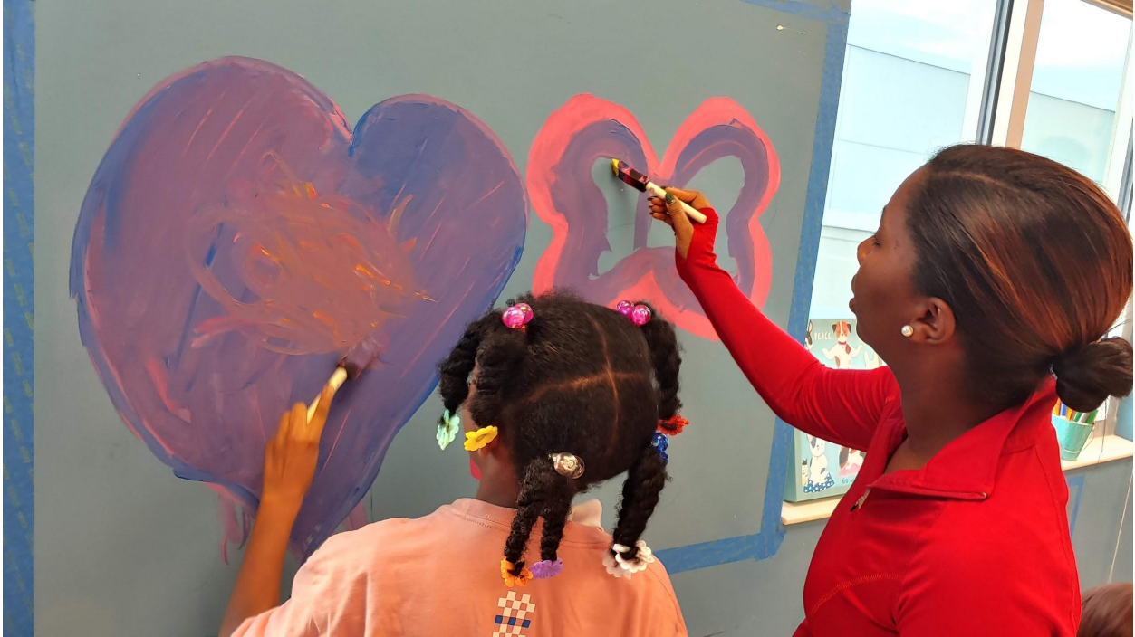
Bank of America Volunteer with Mindfulness Zone student at Gadsden Elementary School

At Brock and Gadsden Elementary Schools we began to set up Mindfulness Zone spaces, and to co-create a vision for how the Program would be used at each school. We consulted with principals, assistant principals, counselors, school social workers, behavior specialists and teachers to design versions of the program that would best support the unique needs of each school. With the support of volunteers from Bank of America, students at Gadsden were able to create murals on the walls of the classroom that will become their dedicated Mindfulness Zone space.